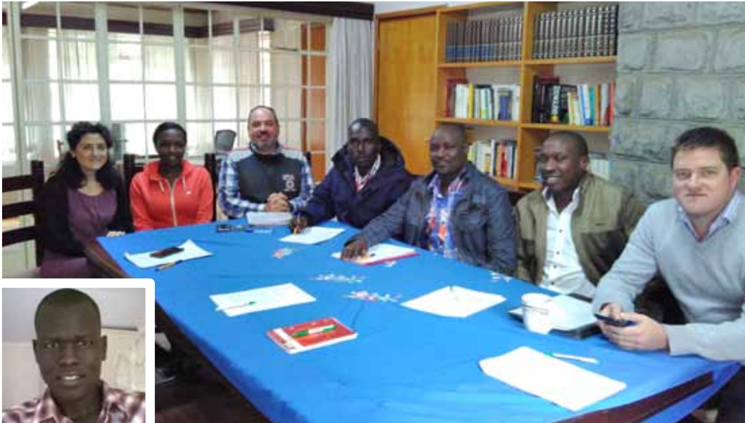
The Team in the Nairobi-Office and the Field-Correspondent in South Sudan.